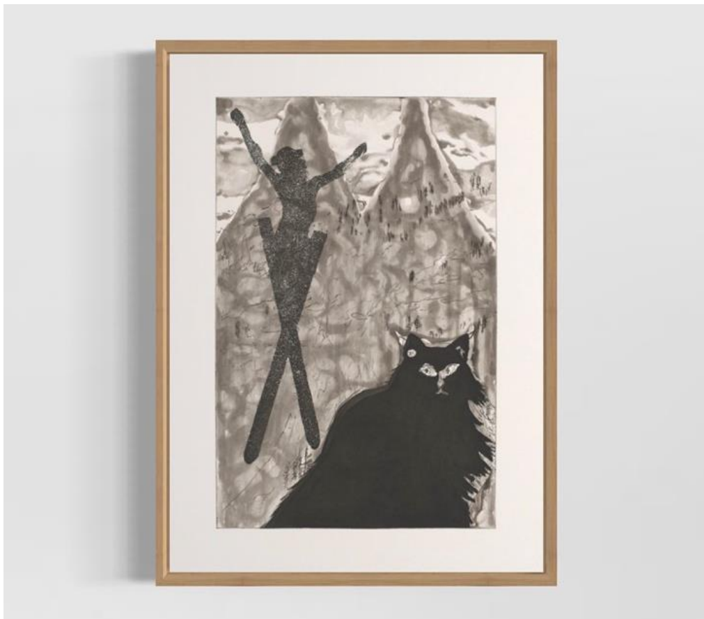
Cat, Christ, Avalanche, 2021