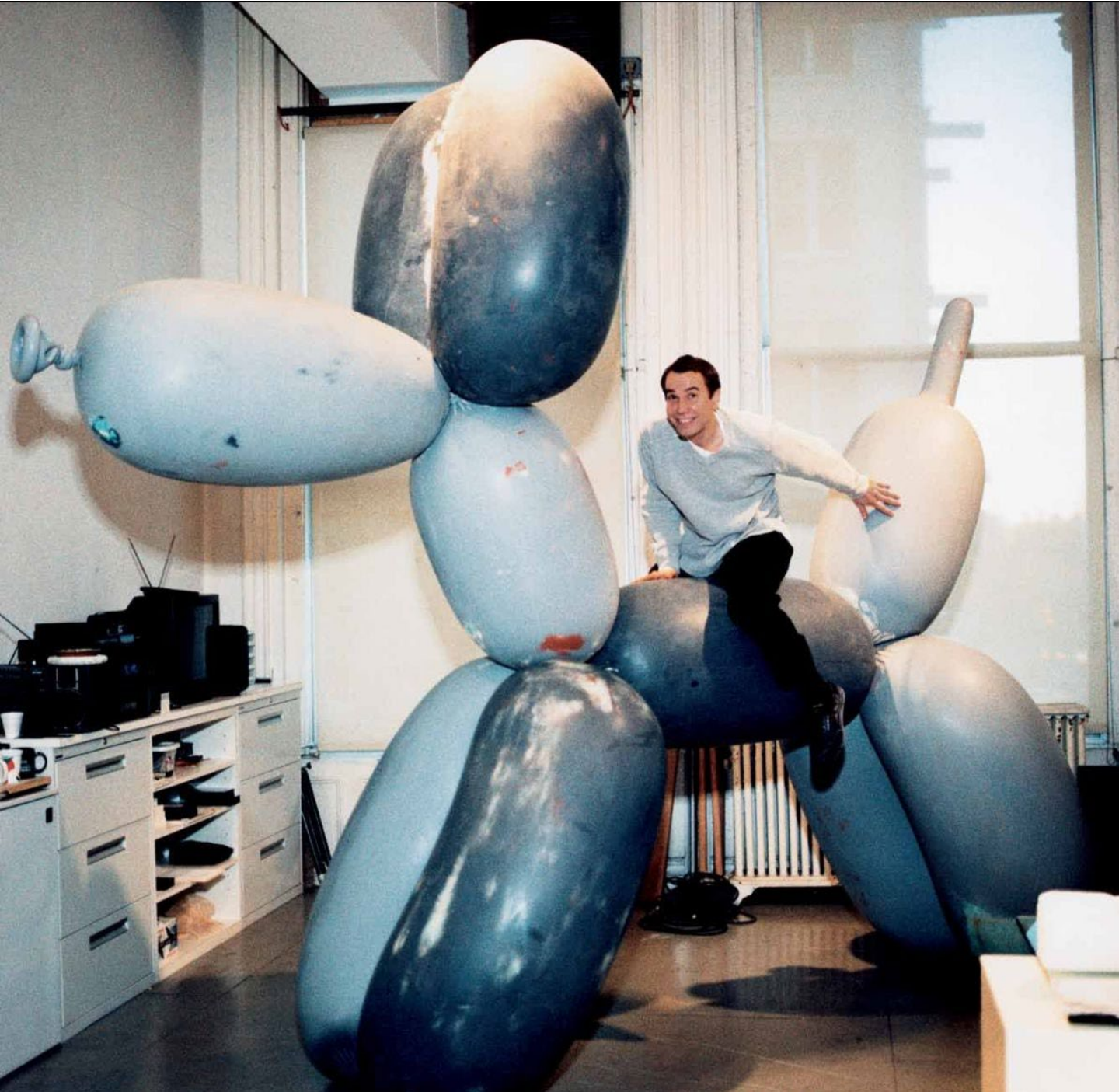
Jeff Koons in his studio, 1997.

"I want the viewer to be able to stay lost in the abstraction of experiencing a work for as long as possible. The Balloon Dog is part of the Celebration series. I started the series in 1994, I wanted to make a body of work that was really about archetype, to connect people to the monumental and the everyday."