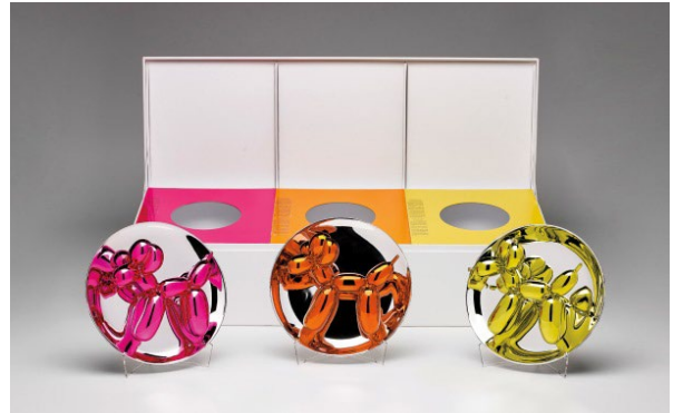
Balloon Dogs Presentation Set, 2015

SBI Art Auction, April 2017 (lot 280) Estimate: $9,000-13,500 Sold for: $10,543