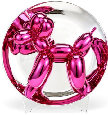
Balloon Dog (Magenta)

Ravenel, December 2018 (lot 51) Estimate: $9,000-12,000 Sold for: $13,994