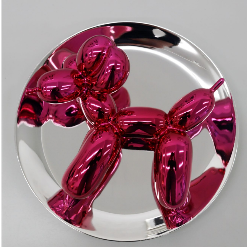
Balloon Dog (Magenta), 2015

French Limoges porcelain with chromatic coating