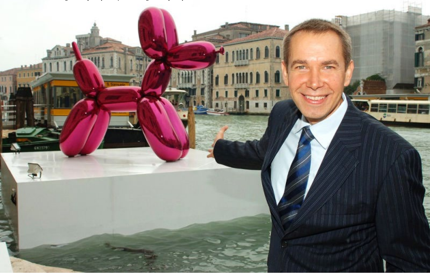
Group show “The World Belongs to You”, at Palazzo Grassi, Venice, Italy, June - December 2011