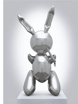
Rabbit, 1986 Sold For: $91,075,000 *Artist Auction Record

With $938 million of artworks sold at auction in 20 years, Jeff Koons is the world's most successful contemporary artist behind Basquiat.