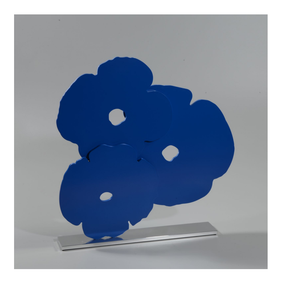
Blue Poppies, 2015

62 \times 61 \times 7.6 cm ( 24.4 \times 24 \times 3 in) Edition of 25 Painted Aluminum on Polished Aluminum Base Engraved on the underside with Title, date and artist's initials