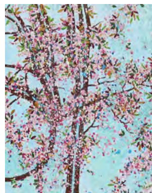
The Virtues, Courage Edition of 760 Bonhams London March 2022 EUR 18,287