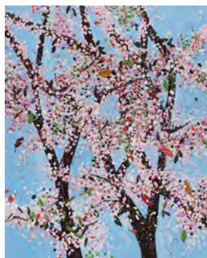
The Virtues, Honour Edition of 693 Christie's Online March 2022 EUR 22,664