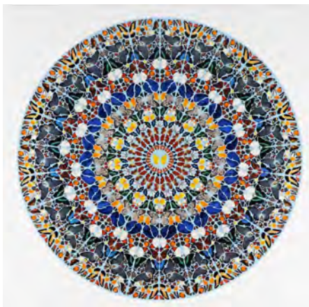
Damien Hirst, 'Mantra' Butterfly Wing Kaleidoscope with Diamond Dust , 2011

The Empresses prints are symmetrical, asymmetrical, and spiral patterns of meticulously organised butterflies that nonetheless exude hope and life – the butterflies feel as if they are taking flight. Hirst has consistently used butterflies for their associations to freedom, religion, life and death. The Empresses illuminates and sheds light on these themes. Through this new series, these themes become intertwined with glory, female power and the development of nations, visible through the entrancing twists and turns of these five dazzling and vital visual celebrations.