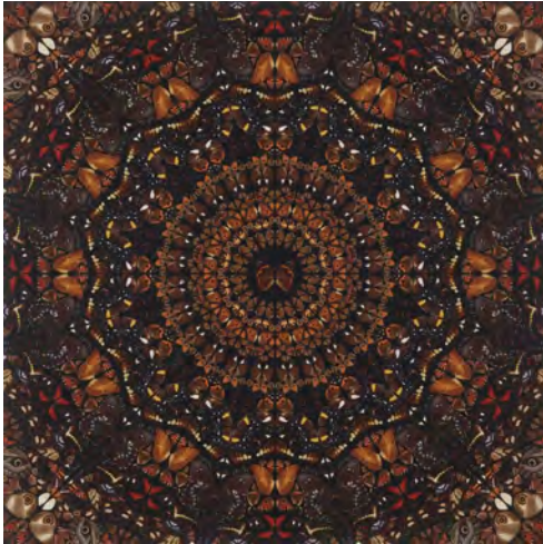
The Elements, Earth (H6-6) Sotheby's London September 2021 EUR 22,410

The series of The Elements created in 2020 by Damien Hirst is a great comparison to The Empresses , 2022 due to its similar subject matter (Kaleidoscope butterfly wing arrangements-or Mandalas ). In addition the scale of both editions is the same. Due to the small edition number of The Elements there are restricted opportunities to see price appreciation, as fewer editions are offered on the secondary market in comparison to the bigger edition size of The Empresses (see comp. between The Virtues series of bigger edition size series).