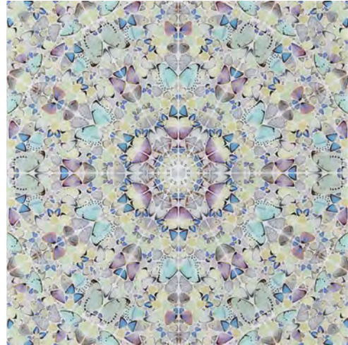
The Elements, Air (H6-7) Christie's London London 2021 EUR 17,618