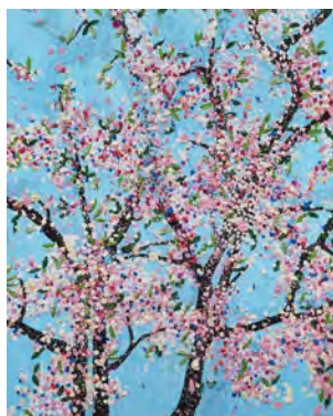
The Virtues, Politeness Edition of 1549 Bonhams London March 2022 EUR 25,782