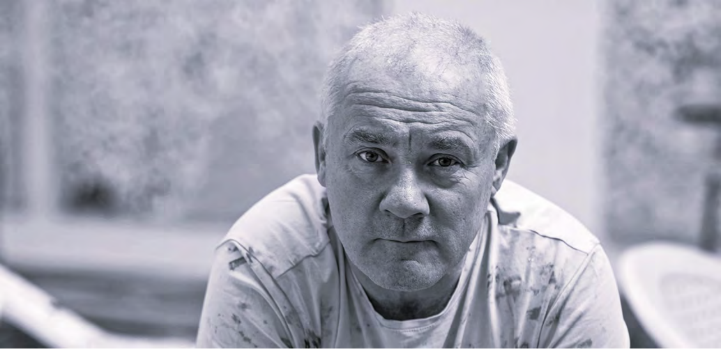
Damien Hirst.

Damien Hirst is a British artist whose name has become synonymous with contemporary art. Since his generative work as a student at Goldsmiths School of Art, Hirst's production has been boundary redefining in nature. Working primarily in installation, painting, sculpture and drawing, Hirst explores the complex relationships between art, beauty, religion, science, life and death. He constantly returns to his foundational interests and themes, which he reworks to develop an innovative visual language. Since the beginning of his career Hirst has interacted with the butterfly, one of his best-known motifs. Inspired by a chance encounter in his studio and the intricate patterns found on Victorian tea trays, in The Empresses Hirst develops on the complex compositions he invented in his Kaleidoscope Paintings and Mandalas series.