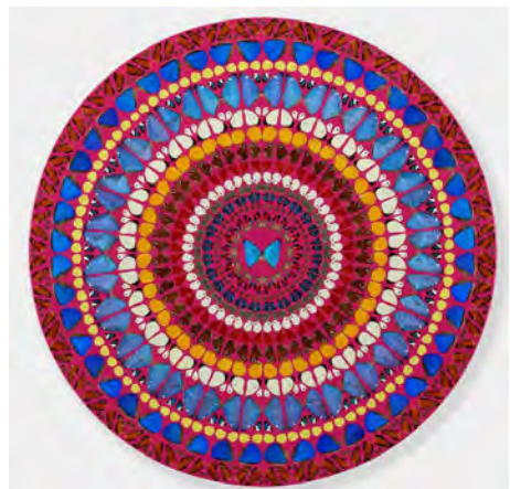
Damien Hirst, Subservience , 2019