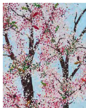
The Virtues, Honesty Edition of 728 Sotheby's London March 2022 EUR 24,175