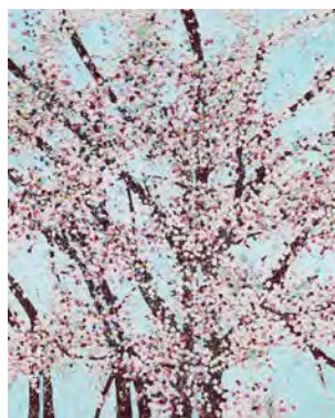
The Virtues, Mercy Edition of 817 Phillips New York March 2022 EUR 22,022