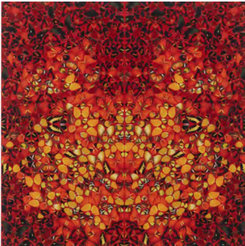
The Elements, Fire (H6-8) Phillips London, April 2021 EUR 21,420