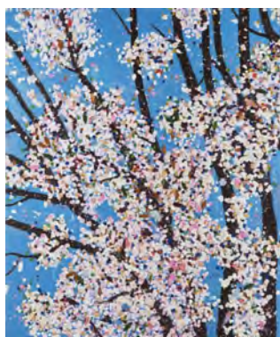
The Virtues, Justice Edition of 1005 Phillips New York March 2022 EUR 21,134

*All editions are from The Virtues series, 2021. Diasec-mounted Giclée print on aluminium composite panel Edition size varies, Each is 120 x 95 cm (47.2 x 37.8 in), Numbered and signed