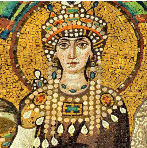
Mosaic of Theodora - Basilica of San Vitale (built A.D. 547), Italy. UNESCO World heritage site.

In Theodora various hues of red and black butterfly wings assemble into an intriguing asymmetrical pattern, the only of its kind from the series. The composition is defined by lines of glittering red, noticeable only at proximity, which symmetrically sections the print horizontally into thirds and vertically in half, as well as establishes a circle in the upper half of the print.