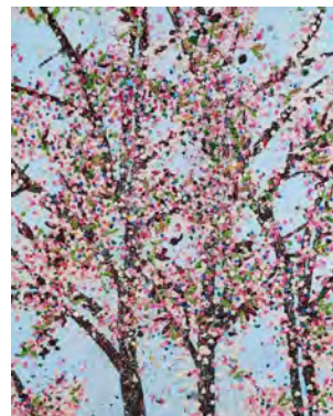
The Virtues, Control Edition of 862 Bonhams London December 2021 EUR 18,824