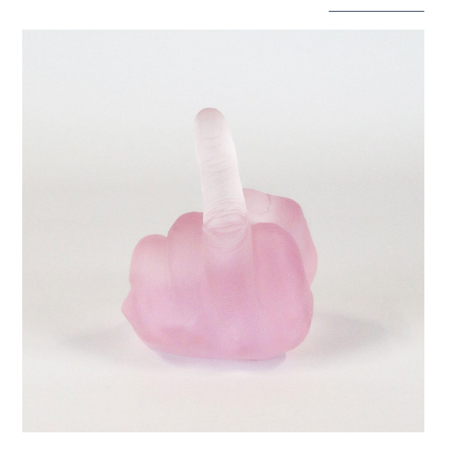
Study of Perspective in Glass, Pink (2020)