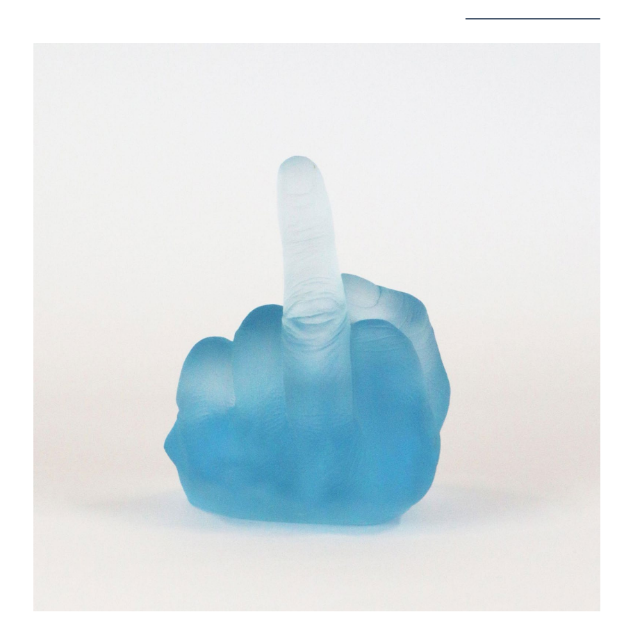
Study of Perspective in Glass, Aquamarine (2020)

Murano Glass Casting Each 10 \times 9 \times 12.5 cm | 4.9 \times 3.9 \times 3.5 in Signed and numbered on accompanying certificate and inscribed on the bottom Edition of 100