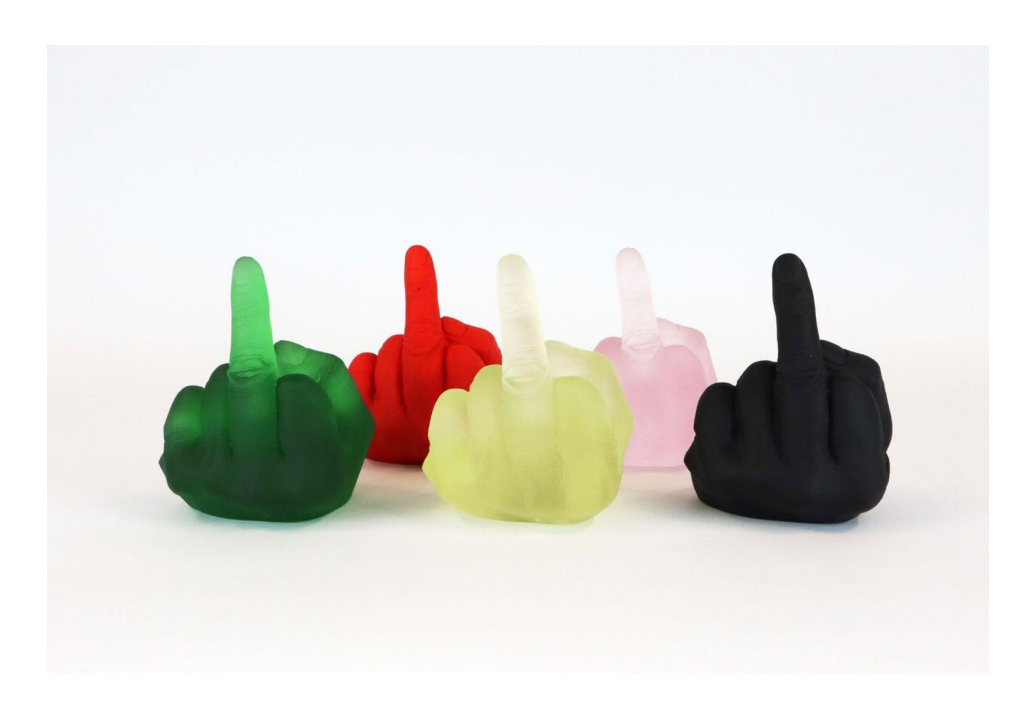
Study of Perspective in Glass, Set of 5 (2020)

Murano Glass Casting Each 10 \times 9 \times 12.5 cm | 4.9 \times 3.9 \times 3.5 in Signed and numbered on accompanying certificate and inscribed on the bottom Edition of 100