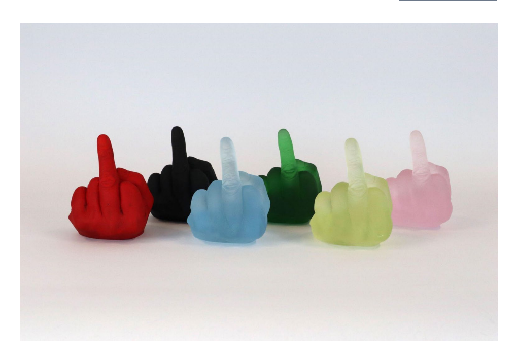
Study of Perspective in Glass, Set of 6 (2020)