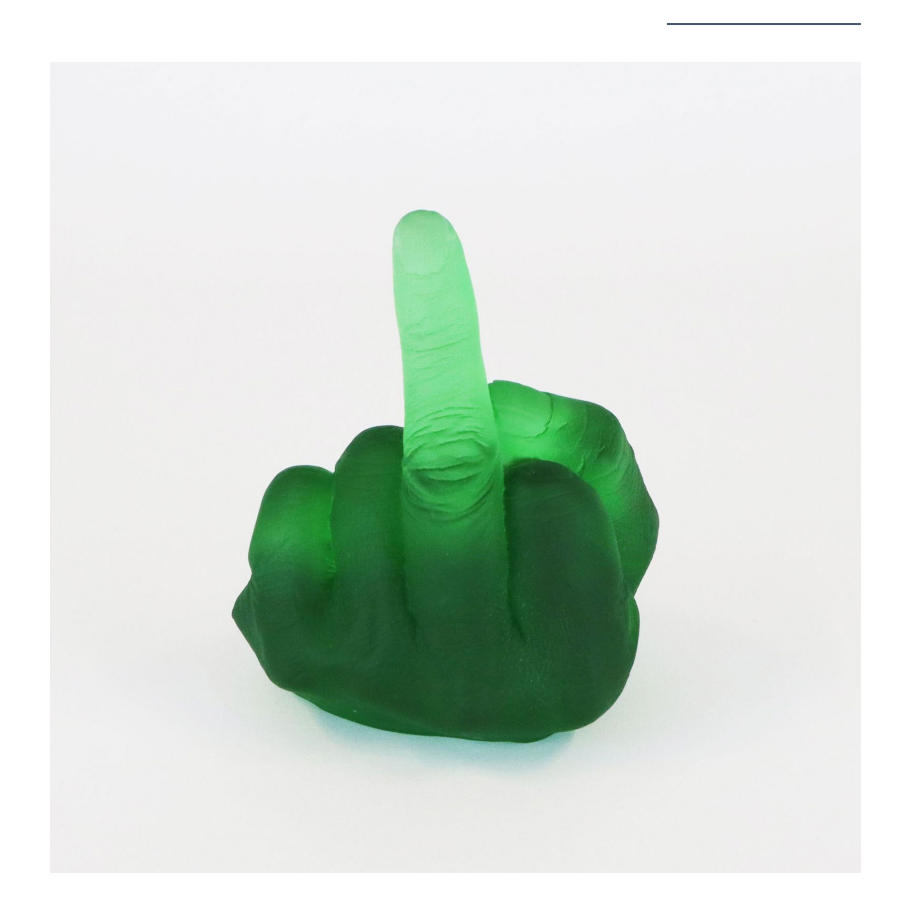
Study of Perspective in Glass, Green (2020)