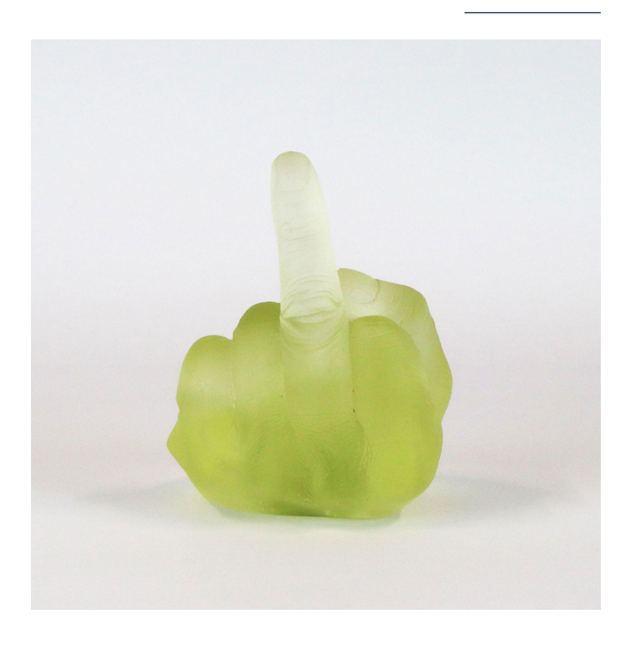
Study of Perspective in Glass, Yellow (2020)