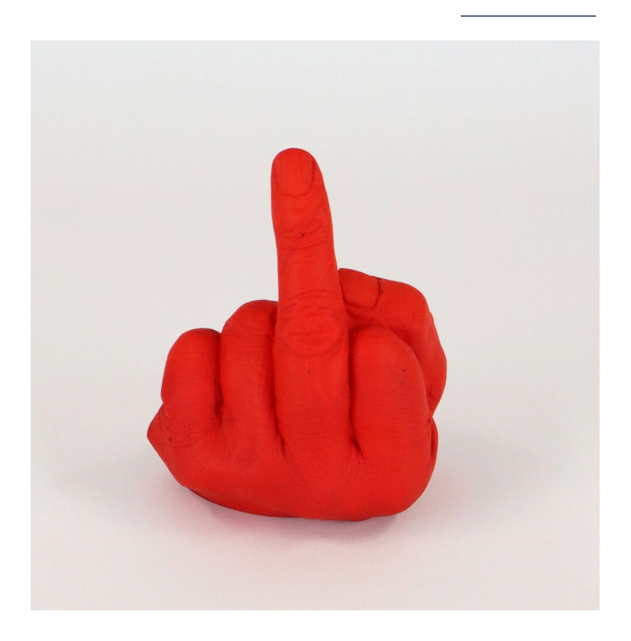
Study of Perspective in Glass, Red (2020)